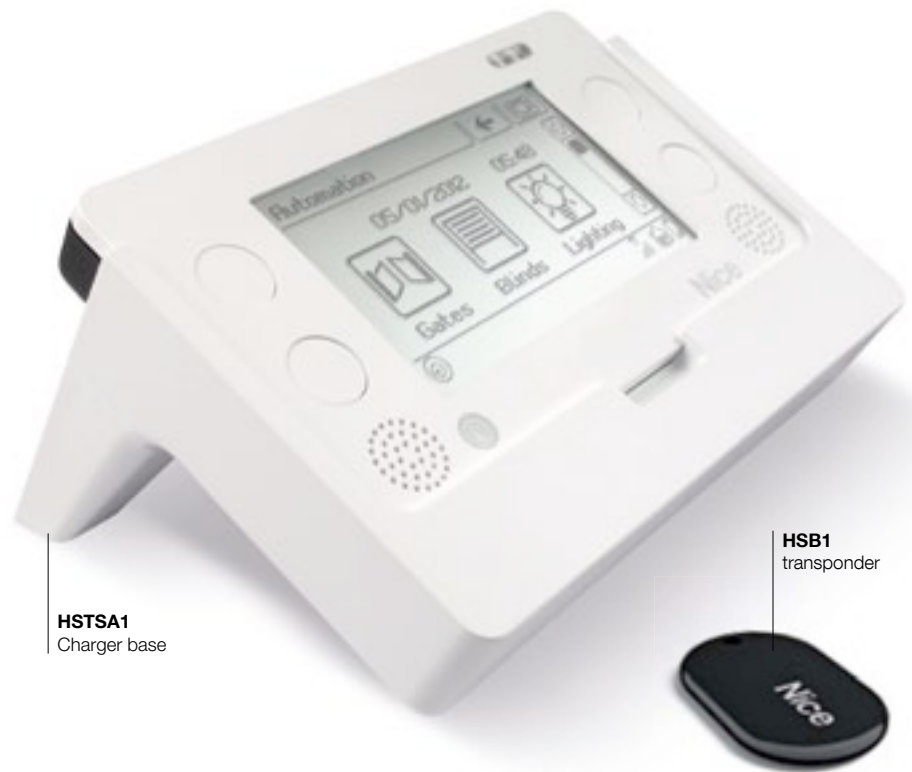
HSTS1 Charger base

New touchscreen to control Nice automations and manage the NiceHome alarm system